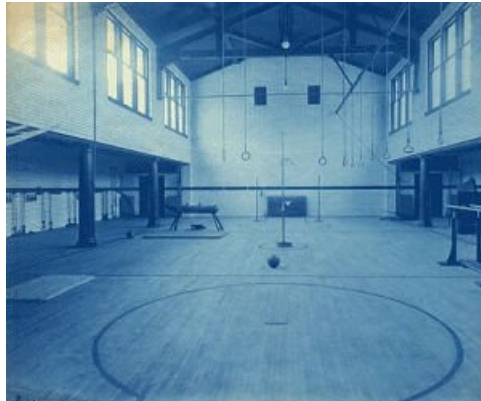
Mather Gymnasium before it was converted to Mather Dance Center